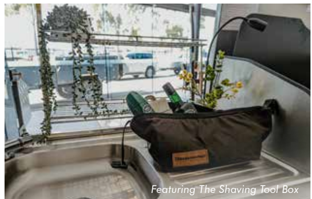
Featuring The Shaving Tool Box