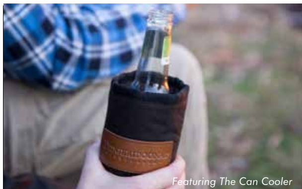
Featuring The Can Cooler