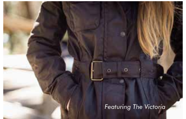
Featuring The Victoria