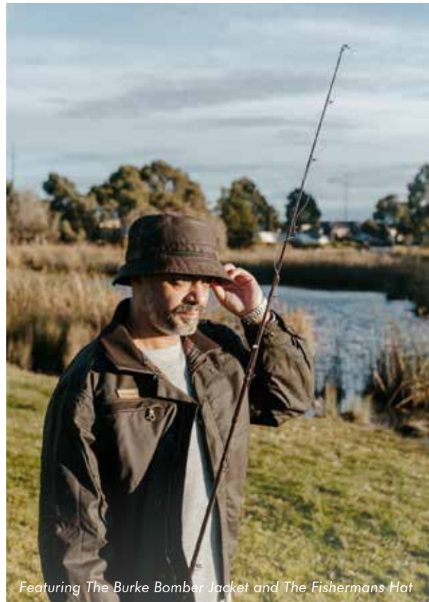
Featuring The Burke Bomber Jacket and The Fishermans Hat