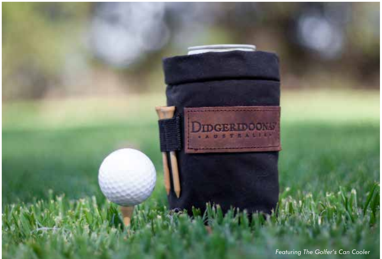
Featuring The Golfer's Can Cooler