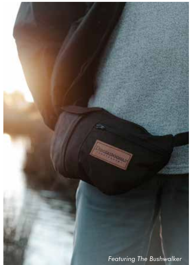
Featuring The Bushwalker