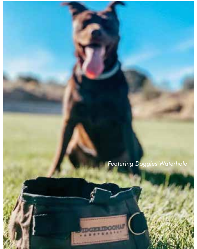
Featuring Doggies Waterhole