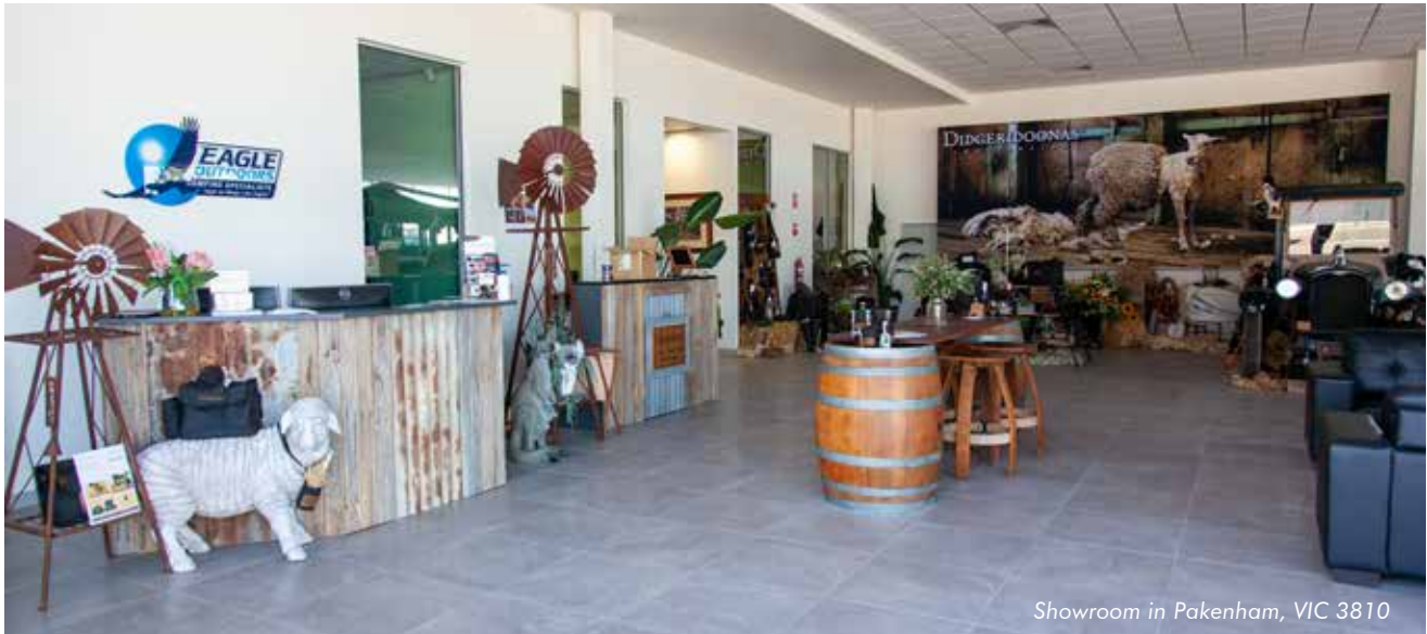
Showroom in Pakenham, VIC 3810