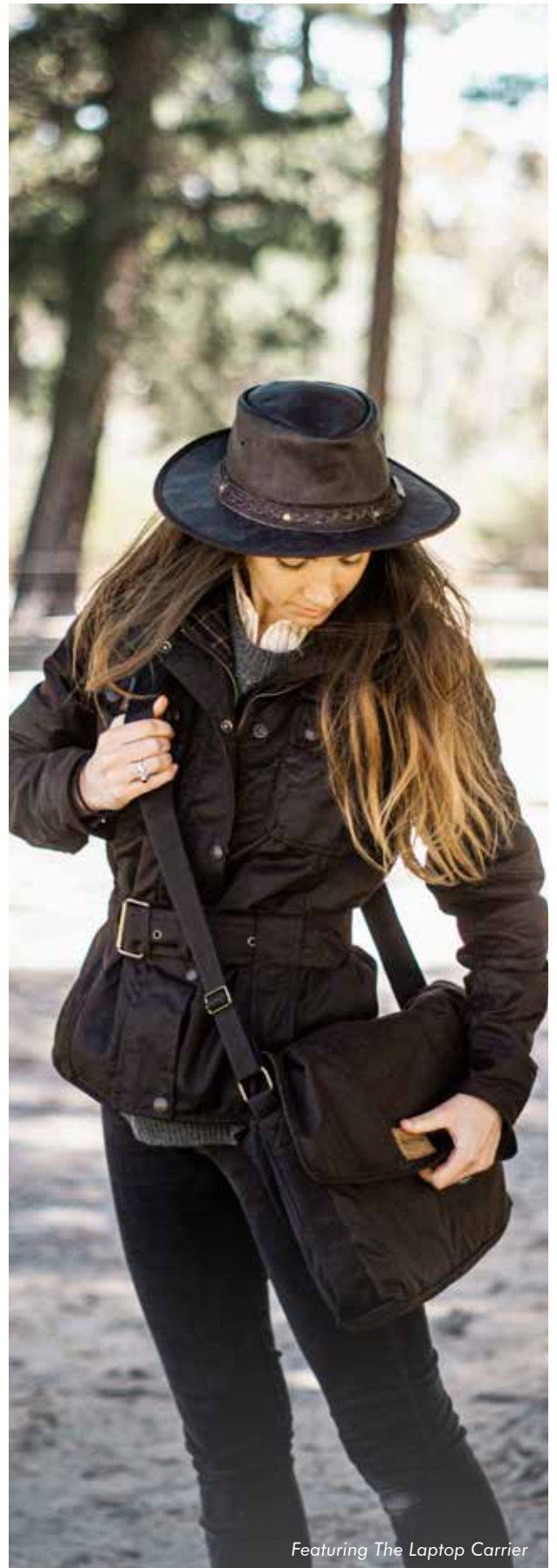
Featuring The Laptop Carrier