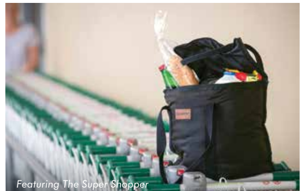
Featuring The Super Shopper