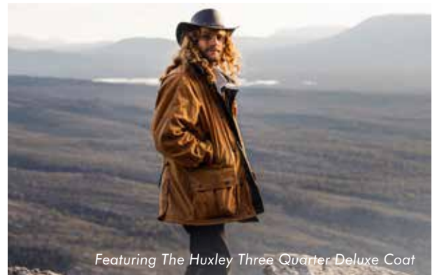
Featuring The Huxley Three Quarter Deluxe Coat