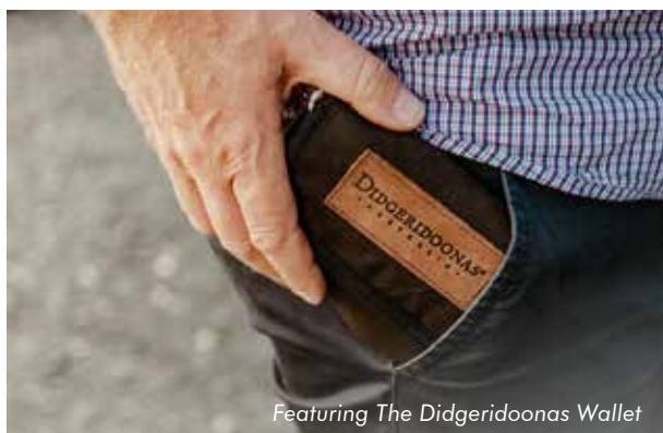
Featuring The Didgeridoonas Wallet