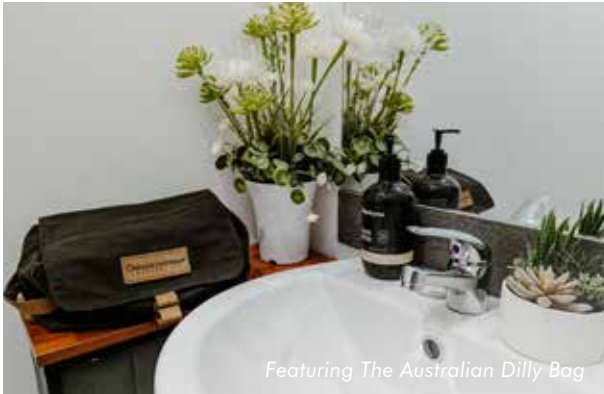
Featuring The Australian Dilly Bag