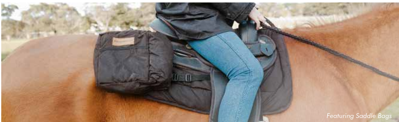
Featuring Saddle Bags